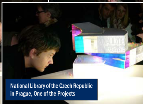
National Library of the Czech Republic in Prague, One of the Projects