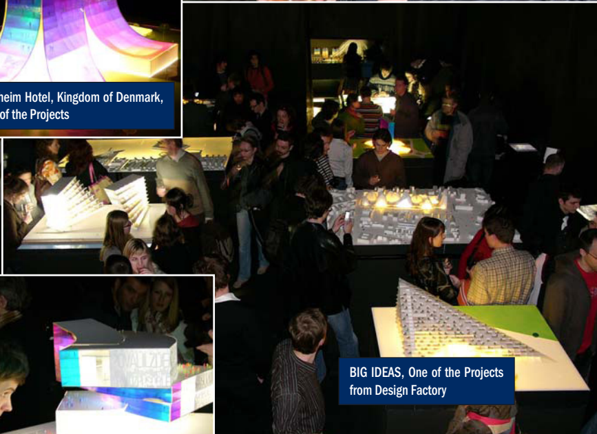
BIG IDEAS, One of the Projects from Design Factory